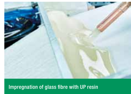
Impregnation of glass fibre with UP resin