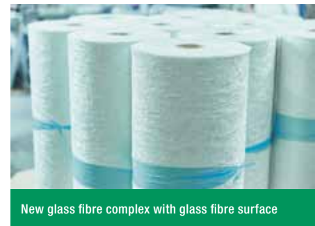
New glass fibre complex with glass fibre surface

The high-pressure jetting resistance of the BB 2.5 was significantly improved, providing an even higher level of security for your rehabilitation projects. The liner even handles the maximum jetting tests of 30 cycles (10 times more than standard) completely unscathed.